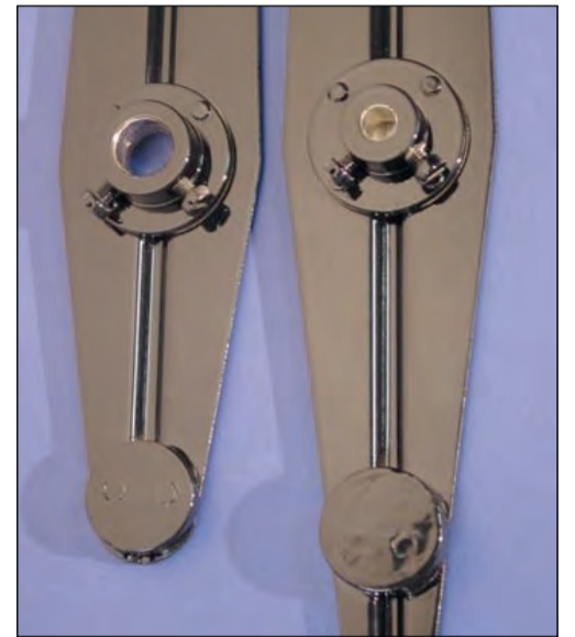
Rear view showing external counterbalance and hand bosses for fixing to driveshafts on movement

Manufactured from aluminium, anodised for maximum corrosion resistance. Externally balanced. Nickel plated brass bosses. Custom designs available to order.