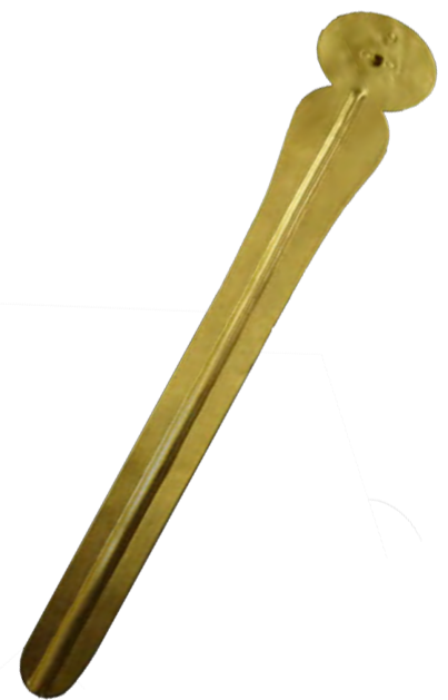
23 1/2 carat gold leaf finished minute hand

Paint finish applied using a two pack acrylic system (as in motor industry). One coat primer, two top coats. Optional finish using best quality double thickness 23 1/2 carat gold leaf.