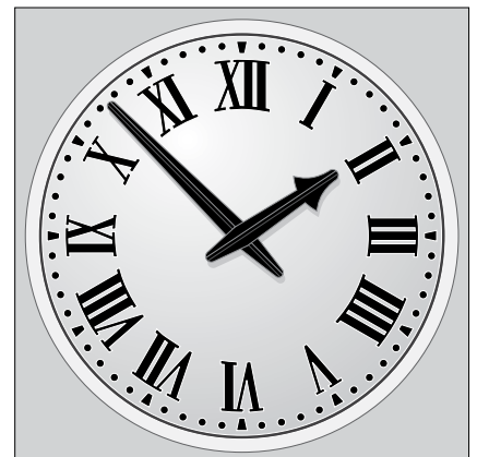
BS 00E55/RAL 9010 white, black finish numerals and H102 hands.