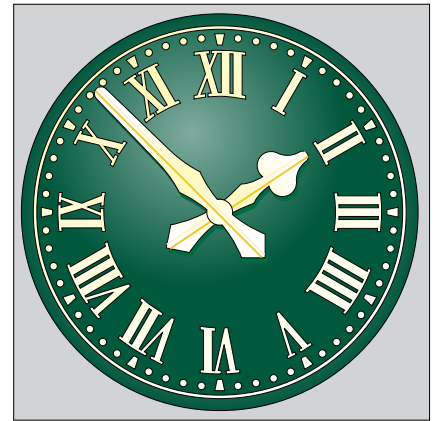
BS 14C39/RAL 6002 green, gold leaf finish numerals and H107 hands.