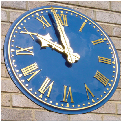
Roman Convex dial, BS 20D45 blue & gold leaf.