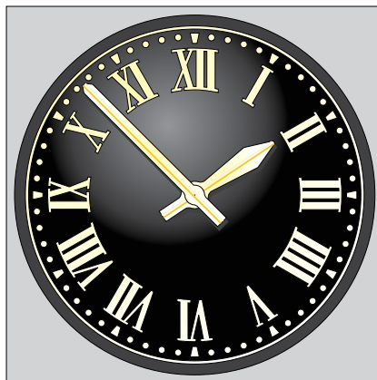
BS 00E53/RAL 9005 black, gold leaf finish numerals and H104 hands.