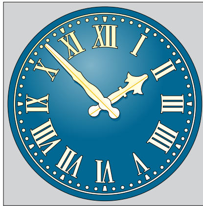
BS 20D45/RAL 5019 blue, gold leaf finish numerals and H101 hands.