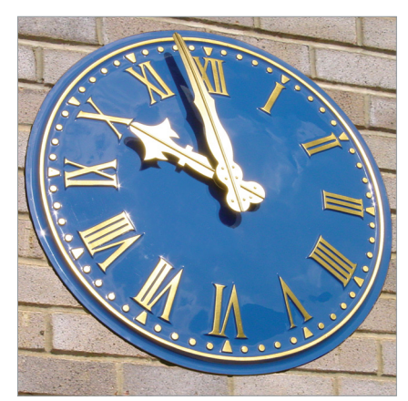
Roman Convex dial, BS 20D45 blue & gold leaf.