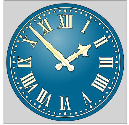
BS 20D45/RAL 5019 blue, gold leaf finish numerals and H101 hands.