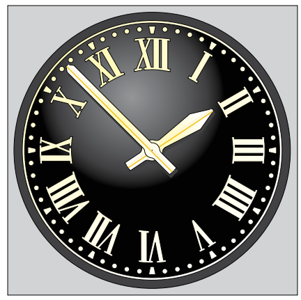
BS 00E53/RAL 9005 black, gold leaf finish numerals and H104 hands.