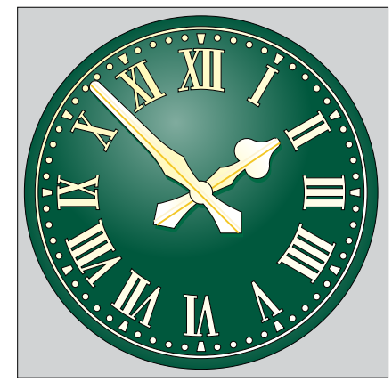
BS 14C39/RAL 6002 green, gold leaf finish numerals and H107 hands.