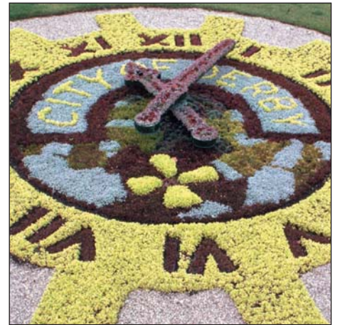
Hands inverted for planting out