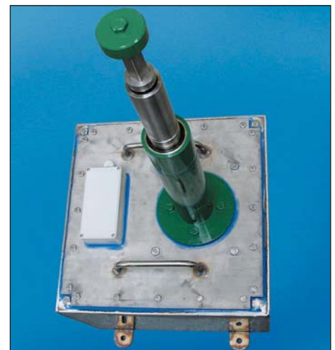
Floral Clock Mechanism

Smith of Derby GROUP www.smithofderby.com