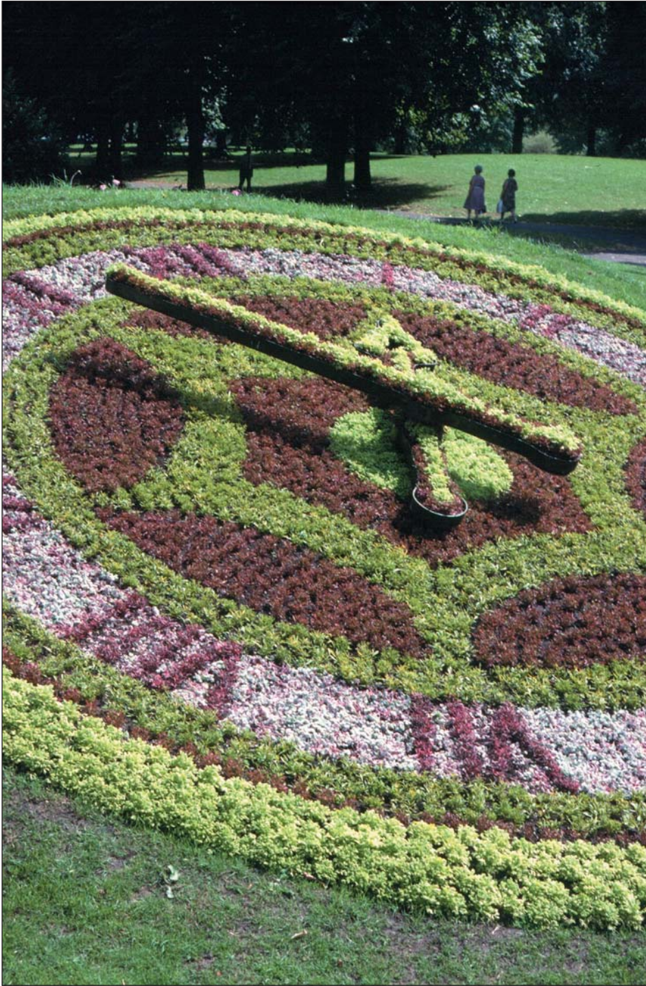
Two hands sizes give up to 5 metre diameter option