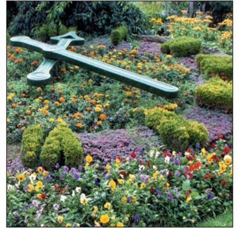
Hands set as "plain" type