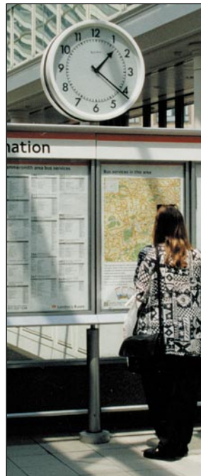
Hammersmith Bus Station