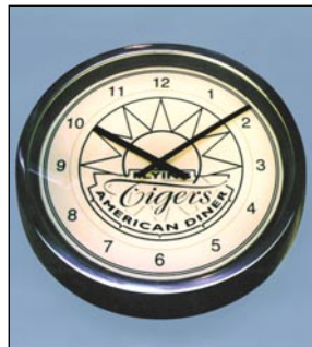
Flying Tigers Diner