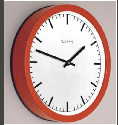
Paint finish case, single bar dial