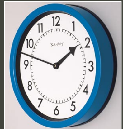
Paint finish case, arabic dial

Reception area clock with illuminated dial for Midland Bank plc