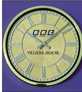
BBC, Villiers House