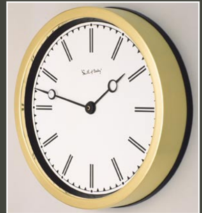
Polished brass case, double bar dial