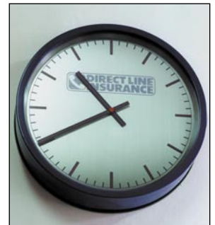
Direct Line Insurance