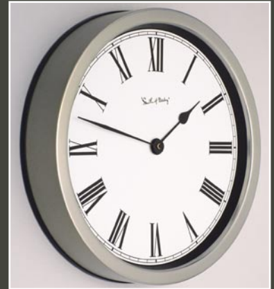
Polished & laquered steel case, roman dial