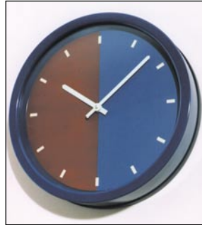
Norwich Union HQ

All our clocks carry a full manufacturers warranty. Installation details available on request.